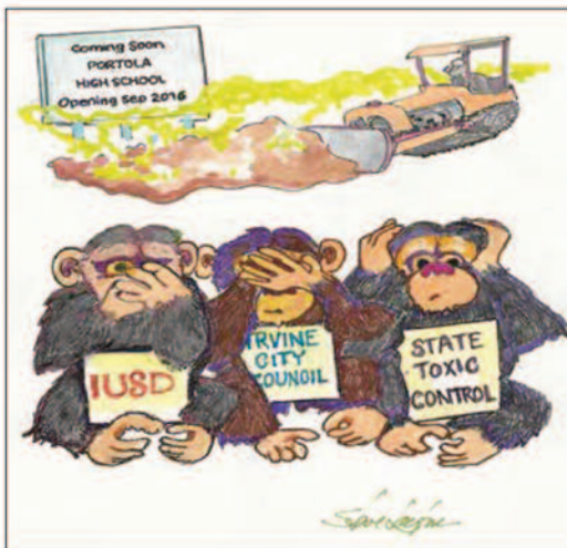
“Toxics? What toxics?”

I’m a homeowner in Portola Springs and I’m vehemently against exposing my children, and other children in my neighborhood, to toxic chemical dangers.