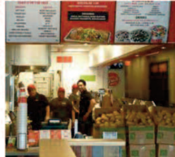
People love MOOYAH'S fresh potatoes.

MOOYAH is open Sunday through Thursday, 11am to 9pm; Fridays and Saturdays until 10pm.