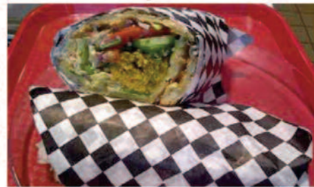
Chicken Shawarma, a popular Cumin wrap.

Cumin partners with non-profits, "Community with a Cause," and hosts "Dine-Out" fundraisers with 10% to 15% of sales going back to the participating schools.