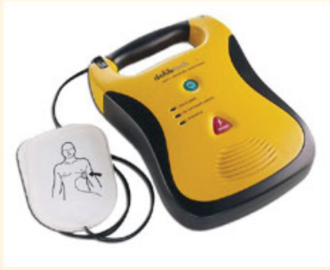
A Defibtech Lifeline AED

This is a good time for City leaders, School District leaders, school nurses and others to undertake a comprehensive citywide inventory of AEDs — and our preparedness as individuals and as a community to save lives in emergencies.