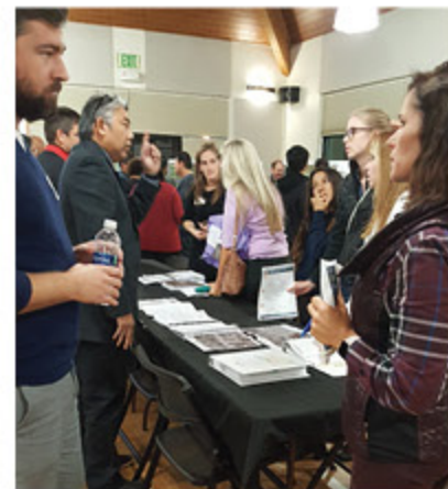
"Open House" format precludes public comments and questions.

The plain truth is that official reports confirm that many locations along the entire length of the southbound side of the I-405 will approach or even exceed permissible noise levels.