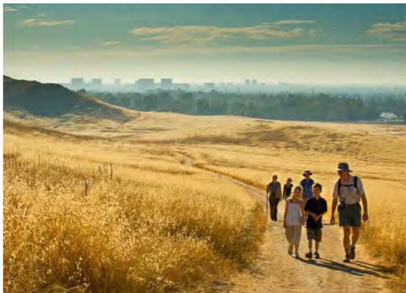
Take a walk on Irvine's miles and miles of open space trails — either self-guided or with the help of an expert guide. For more information, contact: Let'sGoOutside.org.

Twenty-seven years ago, in 1988, the voter-approved Irvine Open Space Plan provided for the permanent preservation of 16,000 acres of hillsides, canyons, and wetlands — to remain forever free of development. For decades now, these beautiful open spaces have been managed by the Irvine Ranch Conservancy. Recently renamed the New Irvine Ranch Conservancy, the organization has just entered into a 10-year renewal and extension of its open space management agreement with the City. In addition to caring for Irvine's open space, the New Irvine Ranch Conservancy sponsors a wonderful array of programs and ways to experience the natural wonders of our community.